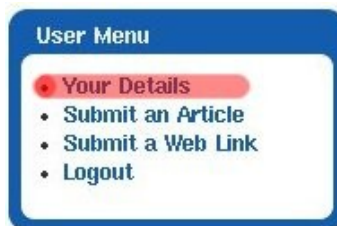
Element of Menu with hinted Your Details position

Now authors of articles can decide that status will be update on his/system account. If you are one of them, go to the „Your Details“: